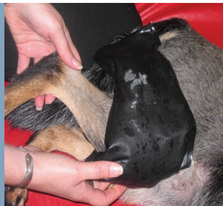
Figure 2. Rebel, a 7-year-old female Australian Cattle Dog recovering from stabilization after cranial cruciate ligament rupture, receives cold therapy delivered using a gel pack after an exercise session. The gel pack is placed around the stifle joint for 10 minutes.

fibers. TENS is effective through a gate-control or counter-irritant mechanism: a large number of benign stimuli compete with the noxious stimuli originating in and around the arthritic joint. TENS has proven benefits in decreasing pain in OA patients; the optimal treatment duration in people appears to be 40 minutes. 18 Neuromuscular electrical nerve stimulation (NMES) is used for muscle strengthening. NMES has some benefits in OA patients; it may be used to strengthen specific muscles in OA patients with severe joint pain or disuse. 19